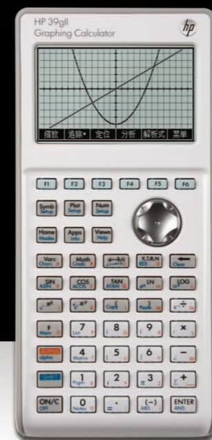
HP 39gII COMING SOON!

To receive HP Solve, our free calculator newsletter, e-mail us at hpsolve@hp.com