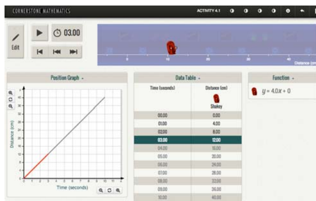
Figure 1. Landmark for Cornerstone Mathematics: different representations of Shakey's journey

The aim of this activity was to explore the software, play the simulation, and watch the effects on the graph, the table of values and the function. Then Shakey's 'journey' could be edited, either by changing the graph (making it steeper or adjusting its starting point.), by changing the function, or by manipulating the simulation itself or any combination of these, and then reflecting on the effects on the journey, while trying to tease out and explain how the different representations were linked. Note that the graph and the narrative – but not the table – can 'drive' the simulation in contrast to the usual situation in which a graph is a read-only representation of it.