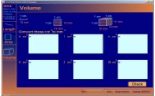
Figure 2: Screen shot of "Concept of Converting Units"

The objectives were addressed through a series of introductory activities that involved introducing basic units, their size, prefixes and how they were used. Activities were then used which targeted length, area and volume and the relationship between them. A screenshot of the software produced can be seen in Fig 2. A full explanation of this completed case study can be found in [9].